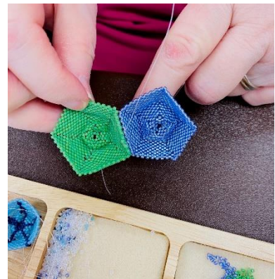
Pam Brummit happily connecting first set for Dodecahedron