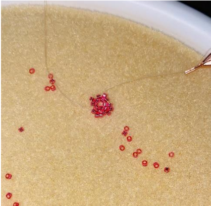
Connie Lagergren starting next dodecahedron section