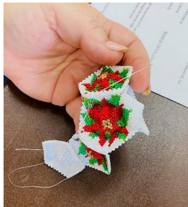
Shawn Brown's original Poinsettia pattern design on Dodecahedron project