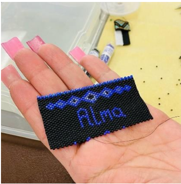
Alma Gholston's beaded nametag in progress