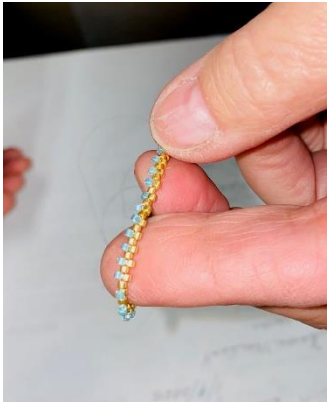
Beth Avney's very first stitching project - Chapter nametag Peyote amulet bag