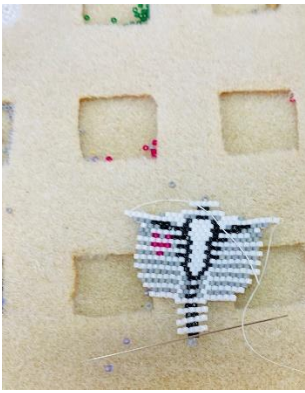
Kathleen Garza's skeleton progress