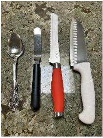
Photo shows utensils that were left at the December potluck. Please look closely and if they are yours, let me know so I can return them to you.