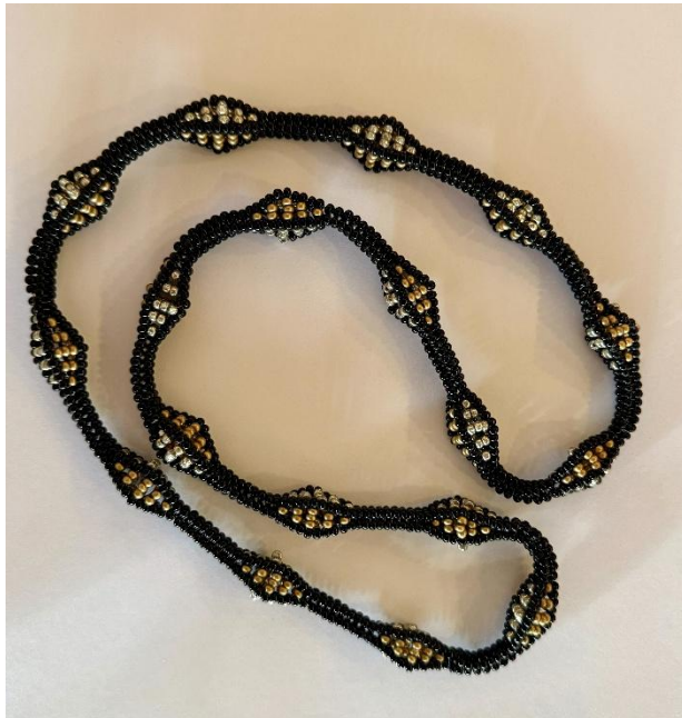
Shawn Brown’s tubular herringbone necklace – Our project for the March Beading Meeting

The final length should fit comfortably over your head as this design is completed in the round and does not include a clasp (Shawn’s necklace is 31” long and has 18 diamond shapes