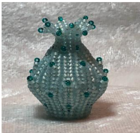
Bitsy the Teeny Tiny Vessel by River Rose

Finally, here is a little teaser for our April structural herringbone project. Remember, if you want to make this cute little 3-dimensional beaded vessel, it is best that you try at least one of the projects from February or March before the April meeting.