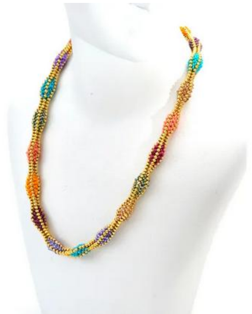
Potomac Beads’ Paintbrush Necklace shows a multi-colored variation of a tubular herringbone necklace